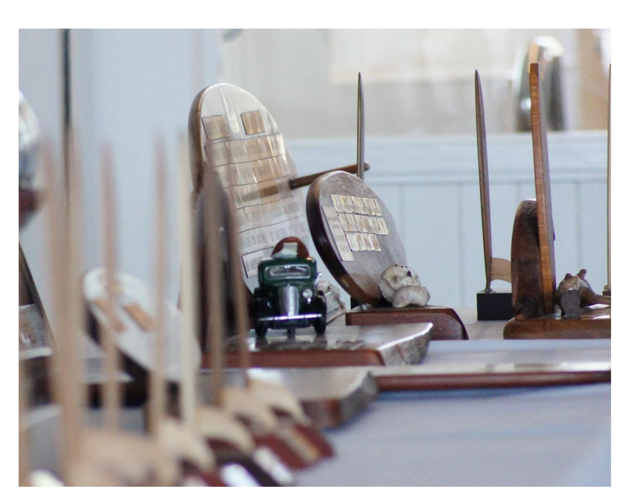
A collection of our perpetual trophies.