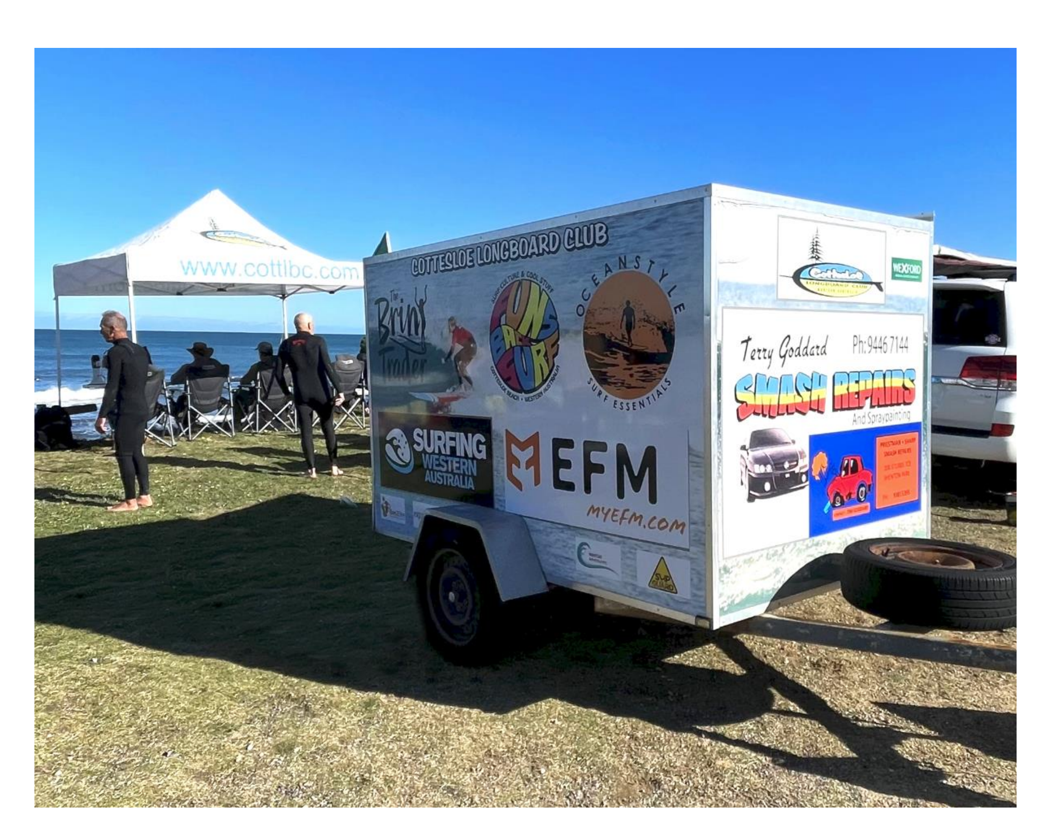
Club trailer at our events with our sponsor decals on show